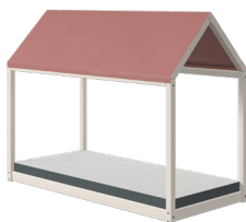
Item no: 83-60013 W:151 L:207