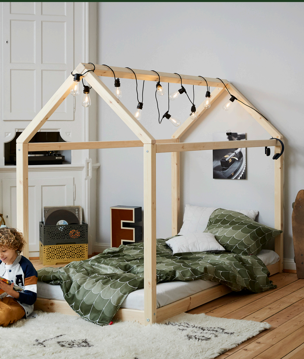
JACOB — 7 years