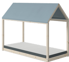
Item no: 83-60012 W:151 L:207