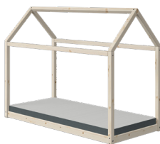
Item no: 80-06901 H:161,8 L: 207,7 W:98,3